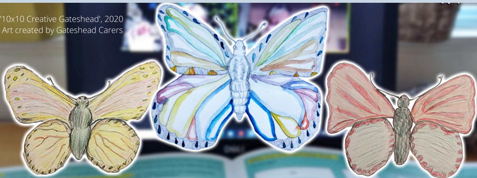
'10x10 Creative Gateshead', 2020 Art created by Gateshead Carers

Funding received from: Arts Council England, Best of Bensham Collaborative and Catherine Cookson Trust