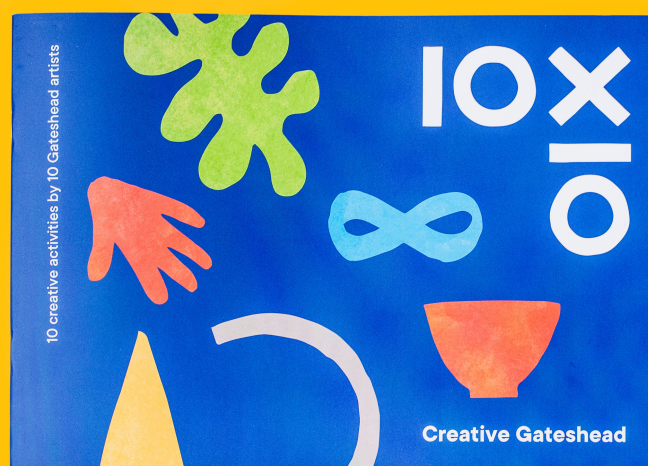
'10x10 Creative Gateshead', 2020

It's great to have something to take your mind away from what is happening at the moment in the world. The Comfrey Project volunteer