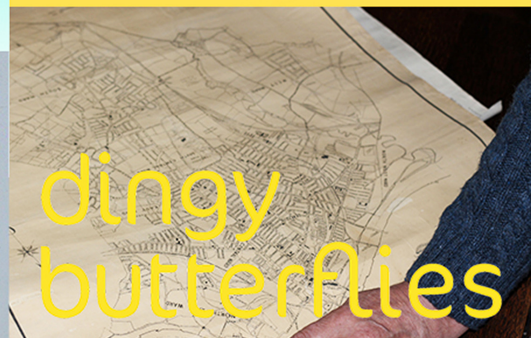
Image credits: Dingy Butterflies CIC (pages 3, 16), Dominic Smith (page 2) Gateshead Carers (pages 4, 7), Daisy Macari (page 10), Saya Naruse (pages 11, 12), Toby Lloyd (page 16), Tom Hewitt (page 16), Marion Botella (pages 5, 6, 8, 9, 14,16) and graphics by Morph Creative (front cover)