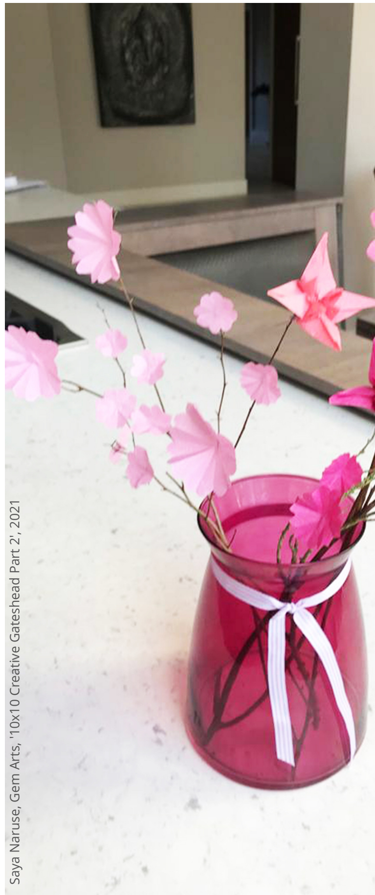
Saya Naruse, Gem Arts, '10x10 Creative Gateshead Part 2', 2021

Bensham Grove Community centre participant